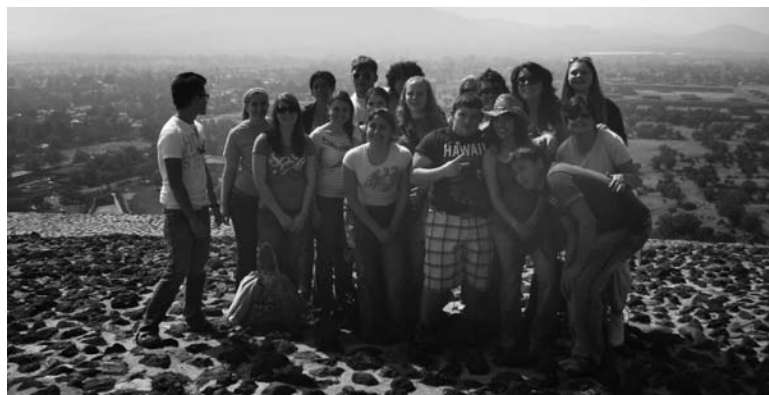
Roane State students pose for a group photo at the Pyramids of Teotihuacan near Mexico City.

The Roane State students arranged for guests from the college to speak to Walnut Hill students. The guests were either natives of a country studied or experts in the country's culture. The college students also participated in a Multicultural Day at Walnut Hill.