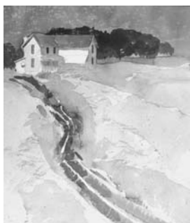
Powers painted this watercolor, "Rural Winter," in the late '70s.