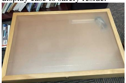
Figure 1: Possible display case for Dr. Lee's memorial

If approved by FS, a representative will reach out to the family to make sure they are okay with a memorial being placed in Arthur's honor. Donations will be collected for a table or podium for the display case to safely reside.