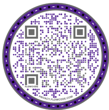
Tennessee Tech's 2+2 Webpage